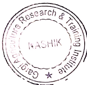
Principal Principal Gargi Agriculture Research & Training Institute