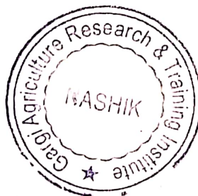
Principal Principal Gargi Agriculture Research & Training Institute